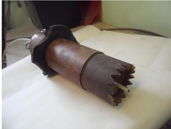
Fig. 2. The appearance of the electr-hydraulic drill

The electro-hydraulic drill works as follows. The pulse capacitor is charged by the high-voltage generator powered from an adjustable current source. When gaining the preset voltage, a breakdown of discharger takes place and all the stored energy in the capacitor through a cable-electrode is transferred to the working clearance.