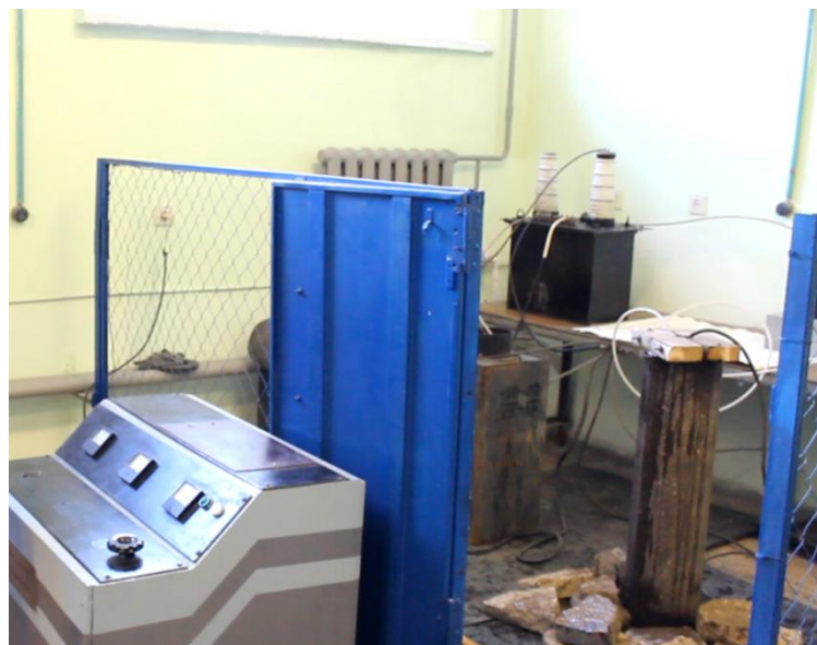
Figure1. Photograph of the general form of an electro-hydraulic plant for well drilling

To form a pulse with a short front of the voltage applied to the discharge gap in a liquid we used a discharge gap in the air that is an air discharger; and to generate a pulse of certain energy we used energy storage electrical capacitor. We have developed and tested an electro-hydraulic plant and a working cell for drilling (Fig. 1).